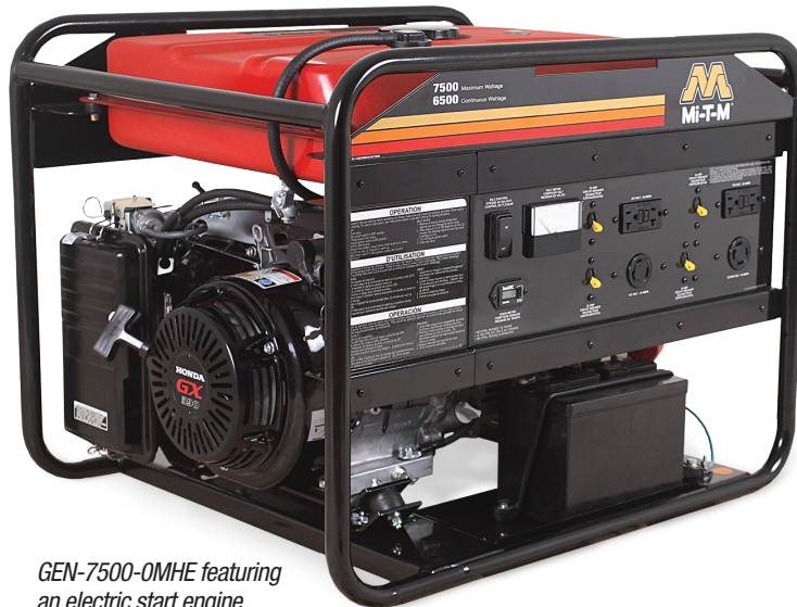
GEN-7500-0MHE featuring an electric start engine

Built to work, you'll want this generator on every jobsite. Its heavy-duty full-wrap frame and impact resistant corners minimizes damage from rough handling. A performance-proven engine makes it reliable and efficient and because it's a Mi-T-M you'll enjoy using it for many years.