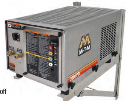
CW-2004-SME3 shown on optional stainless-steel wall mounting bracket (AW-9501-0000)