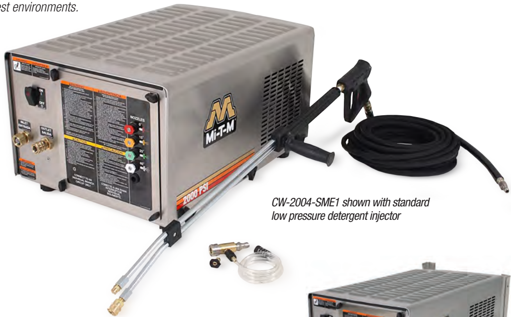
CW-2004-SME1 shown with standard low pressure detergent injector