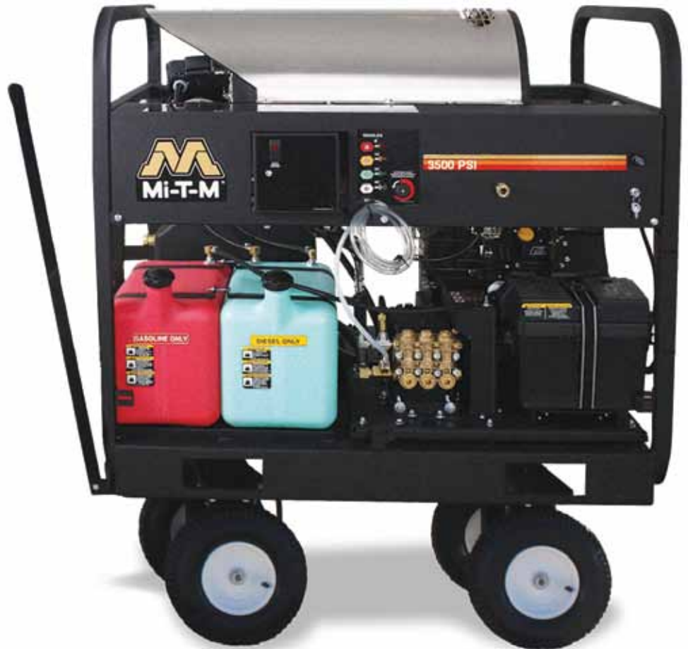
HDC-3505-0K6G shown with optional wheel kit

Large polyethylene float tank prevents rusting