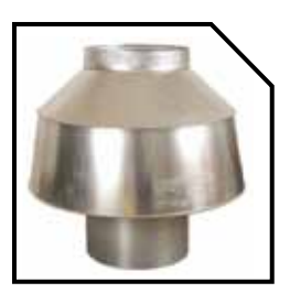
12-inch draft diverter included (24-inch height)