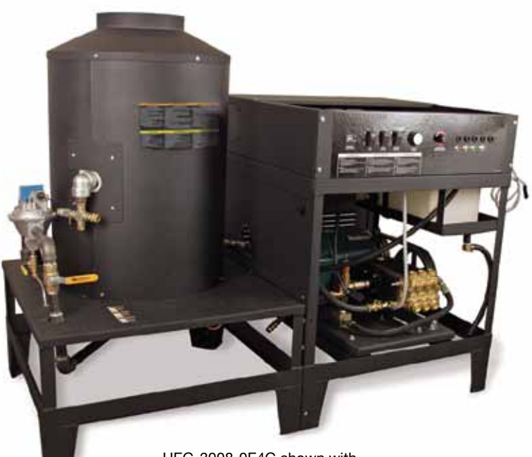
HEG-3008-0E4G shown with panels off

- Temperature rise 150°F/66°C above ambient, maximun outlet temperature is 200°F