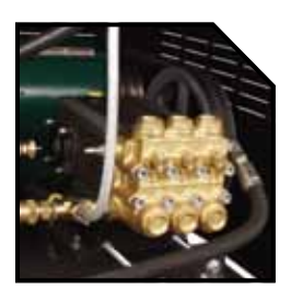
Belt drive triplex ceramic plunger General Pump has the best warranty in the industry

All the same great features you come to expect from Mi-T-M, but with the high volume wash and natural gas/LP features built in. This is an excellent choice for heavy mud and solids removal application.